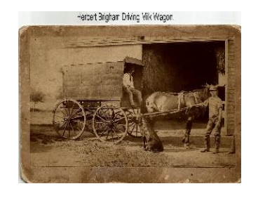
Archival materials Museum Displays